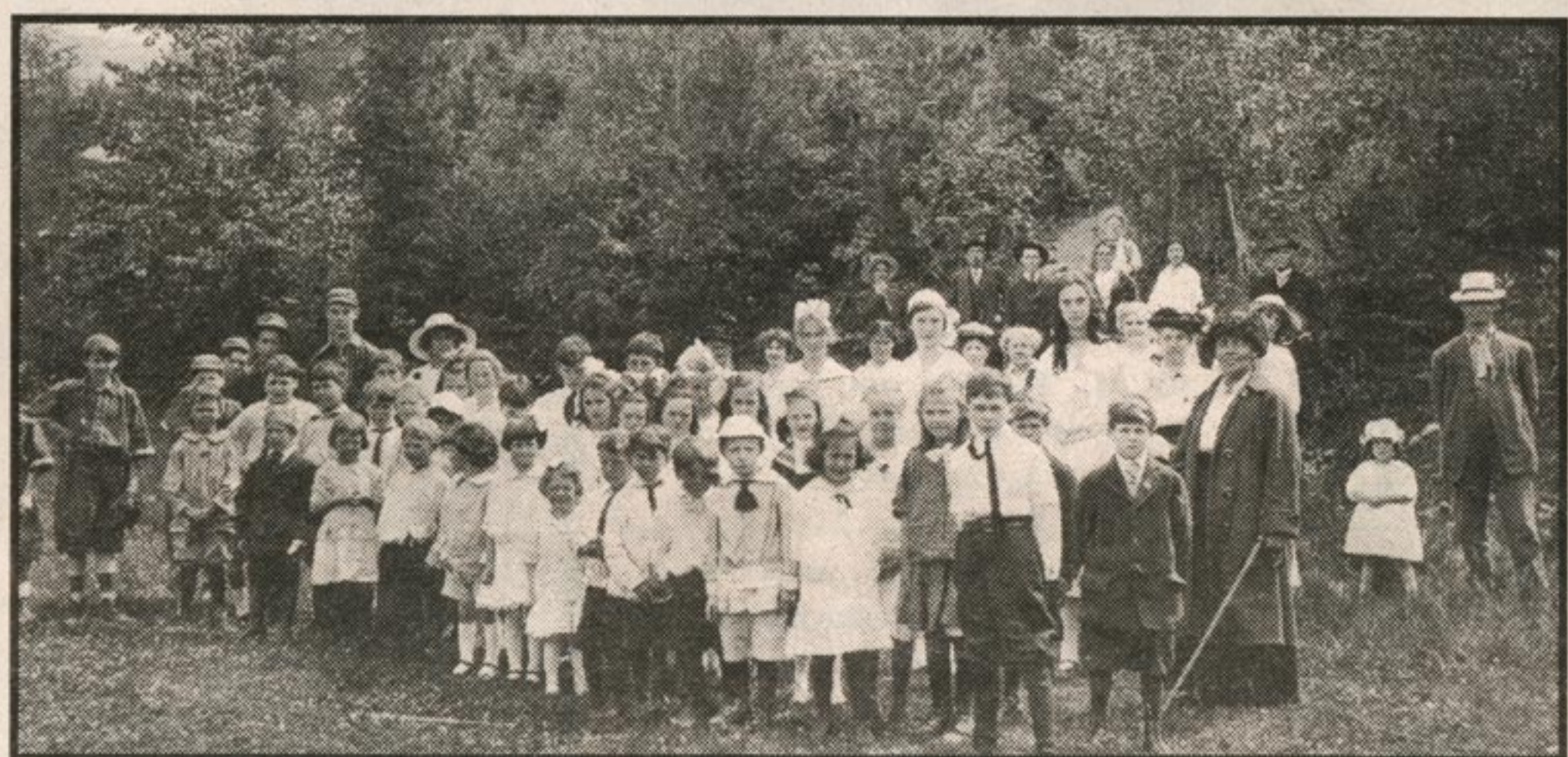
Salmo Museum Photo