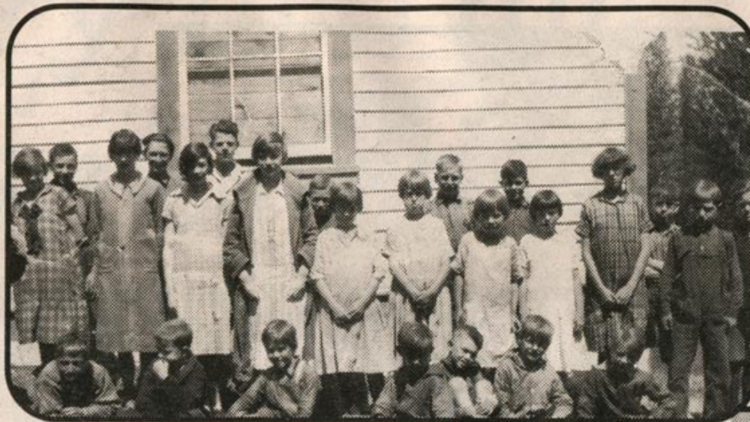
Ymir Public School, June 1926