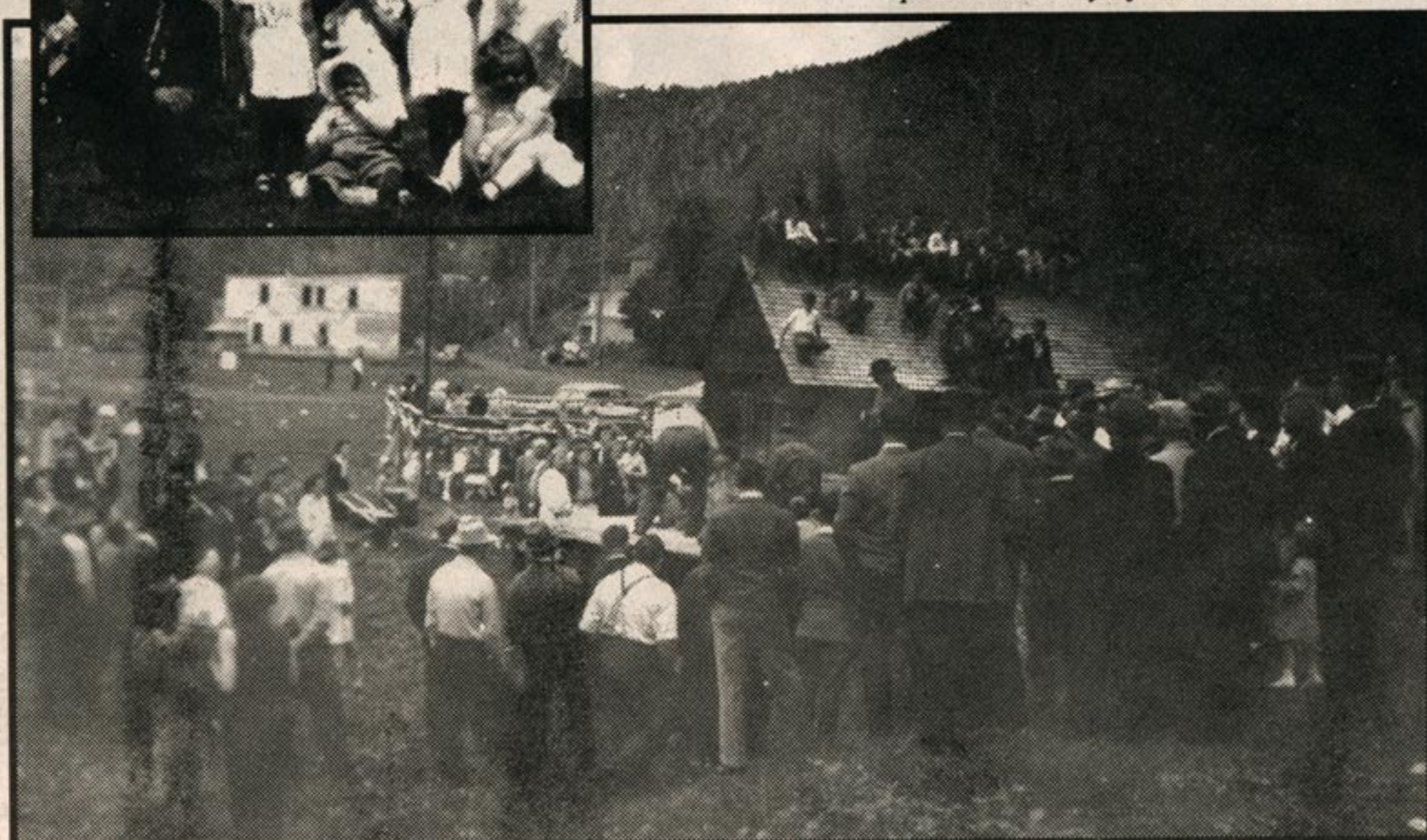
Rock Drilling Competitions.