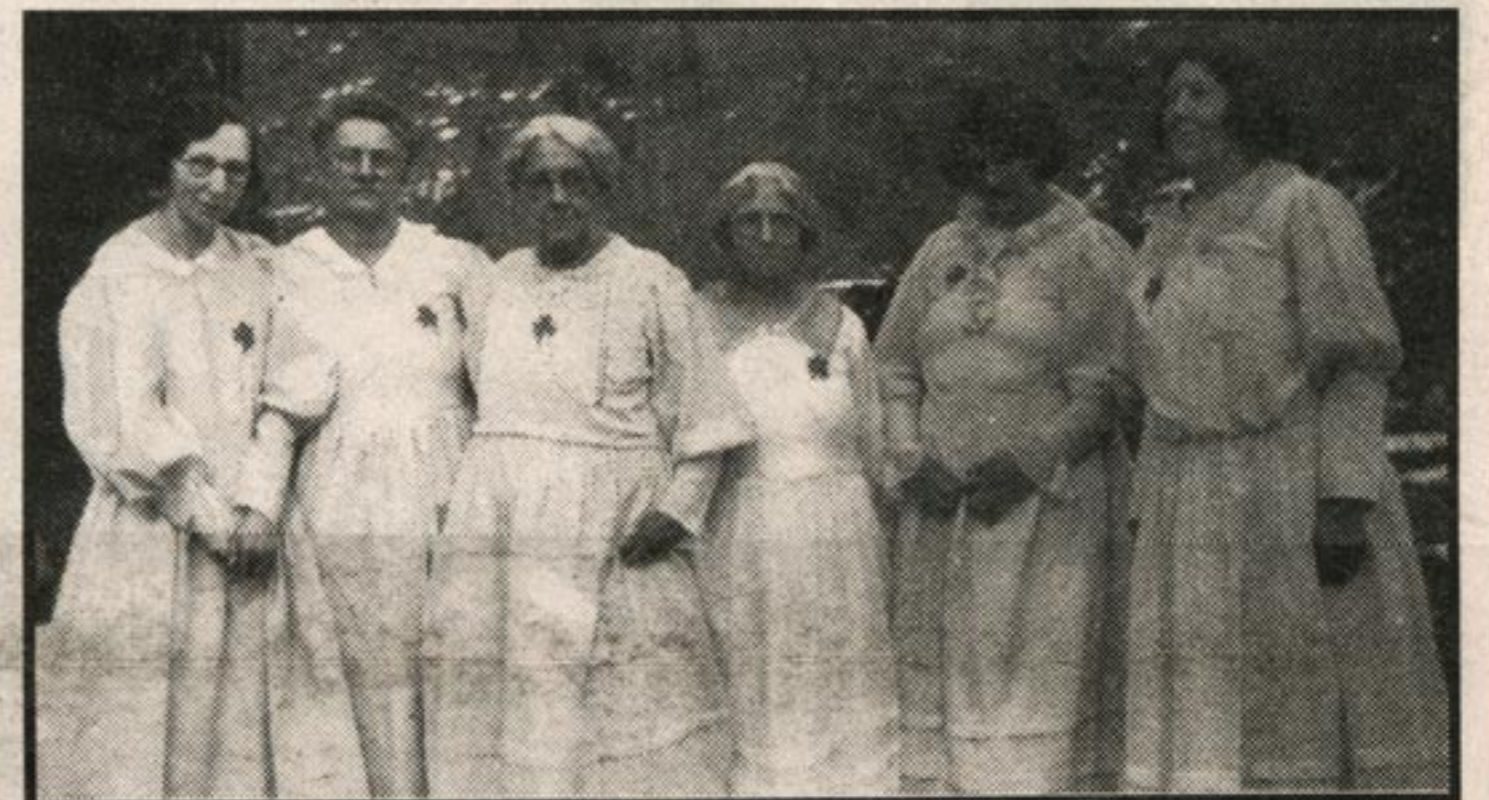
Ymir Ladies Guild